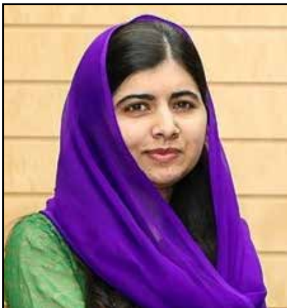
Malala Yousafzai

International Malala Day is July 12, celebrating the young Pakistani advocate for